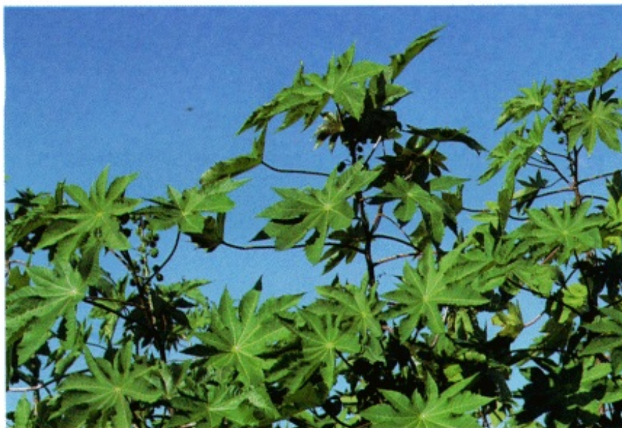
Castor bean, castor-oil plant, palma Christi

Plants basically poison on contact, ingestion, or by absorption or inhalation. They cause painful skin irritations upon contact, they cause internal poisoning when eaten, and they poison through skin absorption or inhalation in respiratory system. Many edible plants have deadly relatives and look-alikes. Preparation for military missions includes learning to identify those harmful plants in the target area. Positive identification of edible plants will eliminate the danger of accidental poisoning. There is no room for experimentation where plants are concerned, especially in unfamiliar territory.